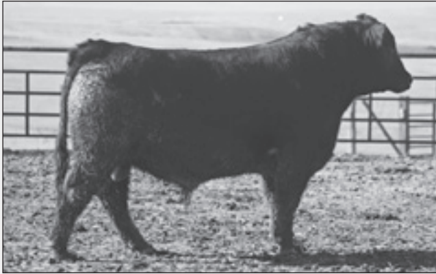
Malsons Diamond 157X - Lot 11