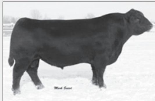
Sitz Upward 307R