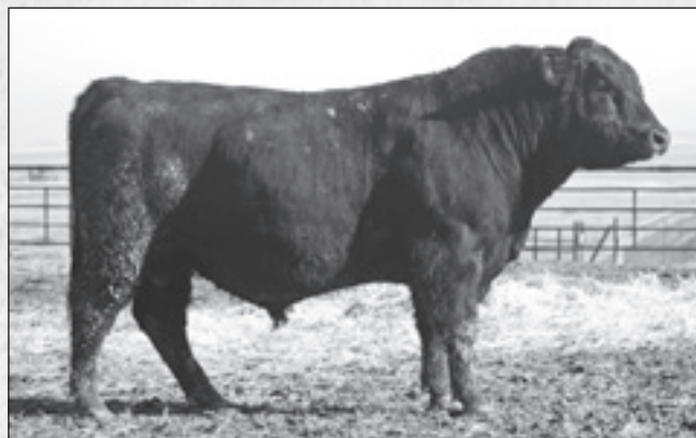
Malsons Hammer 69X - Lot 8

Moderate framed, stout Hammer son. Dam sold to Luepke Angus in Minn.