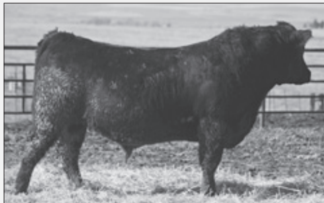
Malsons Diamond 141X - Lot 10