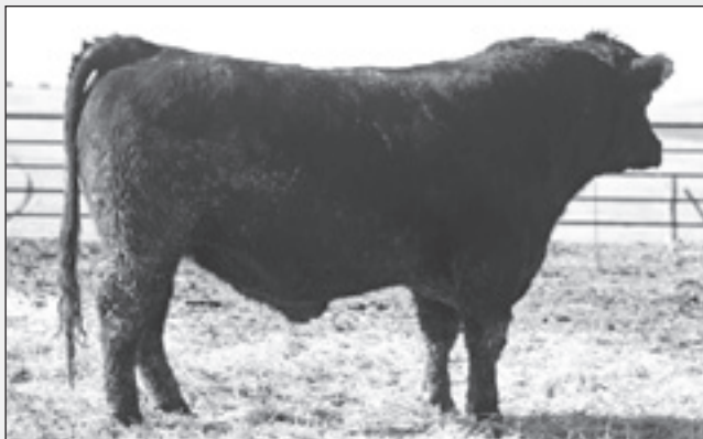
Malsons Hammer 92X - Lot 6