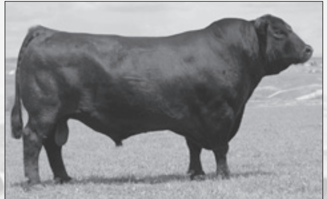
Malsons Cobra 50N - Sire of Lot 50.