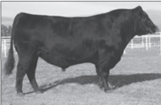
Pine Ridge Hammer S322