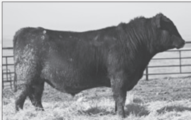
Malsons Pioneer 201X - Lot 2

Recommend for heifers. An exciting herd bull prospect. Look at his spread from birth to yearling. This stout, very complete bull has it all. Sire is the $300,000-valued Pine Ridge Hammer.