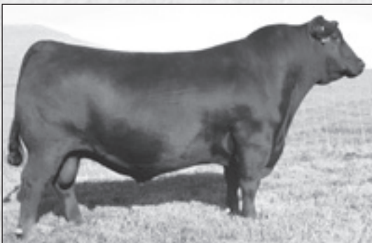
SAV Pioneer 7301