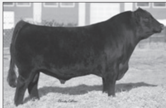
C J Prestige 25T