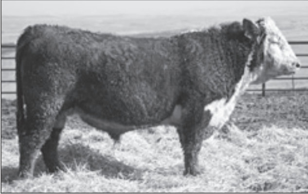
Malsons Outcross 74X ET - Lot 51

54 Malsons Cowboy 11Y Birth Date: 2-9-2011 Bull 43226001 Tattoo: 11Y CJH COWBOY 512 (CHB,DLF,HVF,IEF) C 112K COWBOY 8150 ET (DLF,IEF) 42887715 CL 1 DOMINETTE 0112K 1ET CJH MISTER MOM 350 (DLF,IEF) CJH L1 DOMINETTE 717 CL 1 DOMINO 5131E (SOD,DLF,IEF) CL 1 DOMINETTE 411