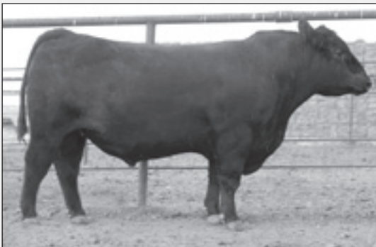
WK Uptown 9372