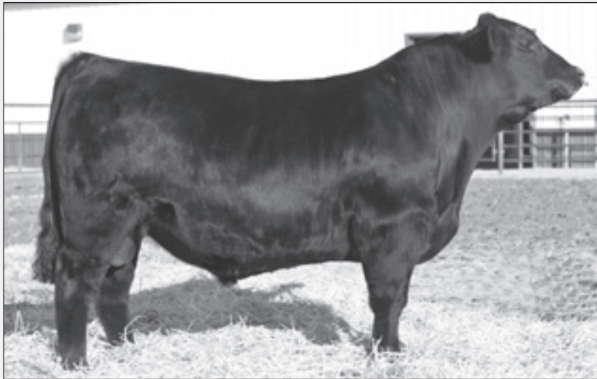
Malsons Hammer 203X - Lot 1