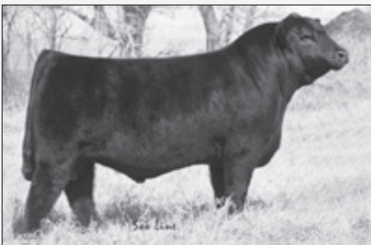
Soo Line Alternative 9127W